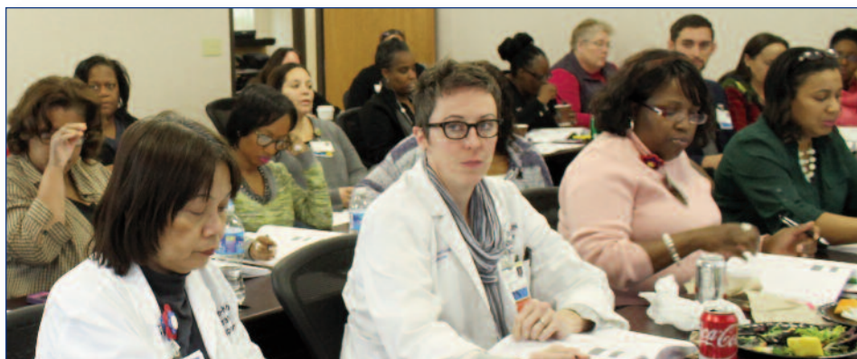
Multiple certification review courses funded by the Center for Excellence in Nursing

Alcohol Withdrawal and CIWA: Clinical Institute Withdrawal Assessment for Alcohol